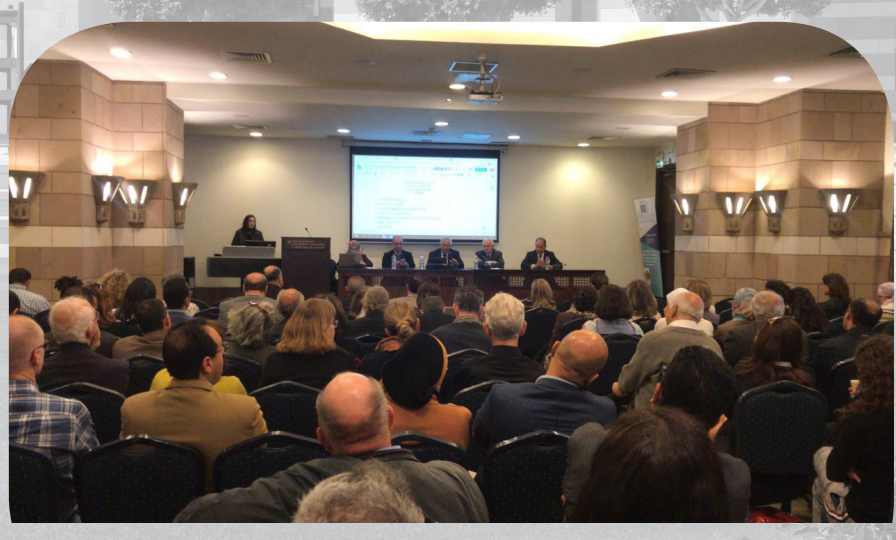
General Faculty Meeting 2019

Much of the University Senate activities takes place within the standing committees. Each committee meets at least twice a month during the academic year to research, review, revise and compose the university policies and proposals for consideration and voting on by the full Senate. The Senate Office coordinates and supports the activities of the Senate and its committees.