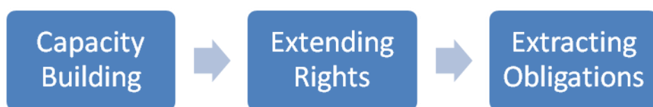
Figure 2.1: Engagement Policy Sequence