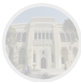
AUC TAHRIR CAMPUS