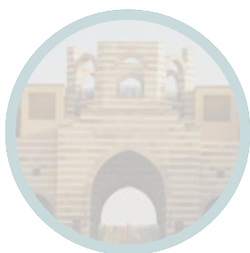
AUC NEW CAIRO CAMPUS